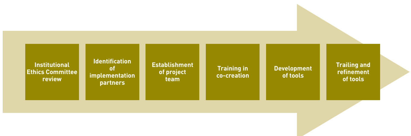
Figure 3.1: The Approach