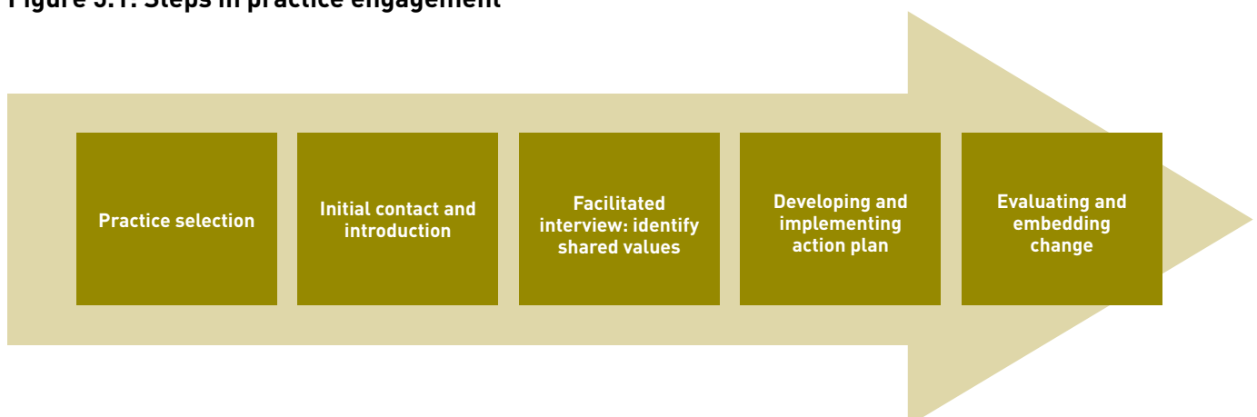
Figure 5.1: Steps in practice engagement

One of these practices was interested in the project, but after a number of attempts at contact, eventually